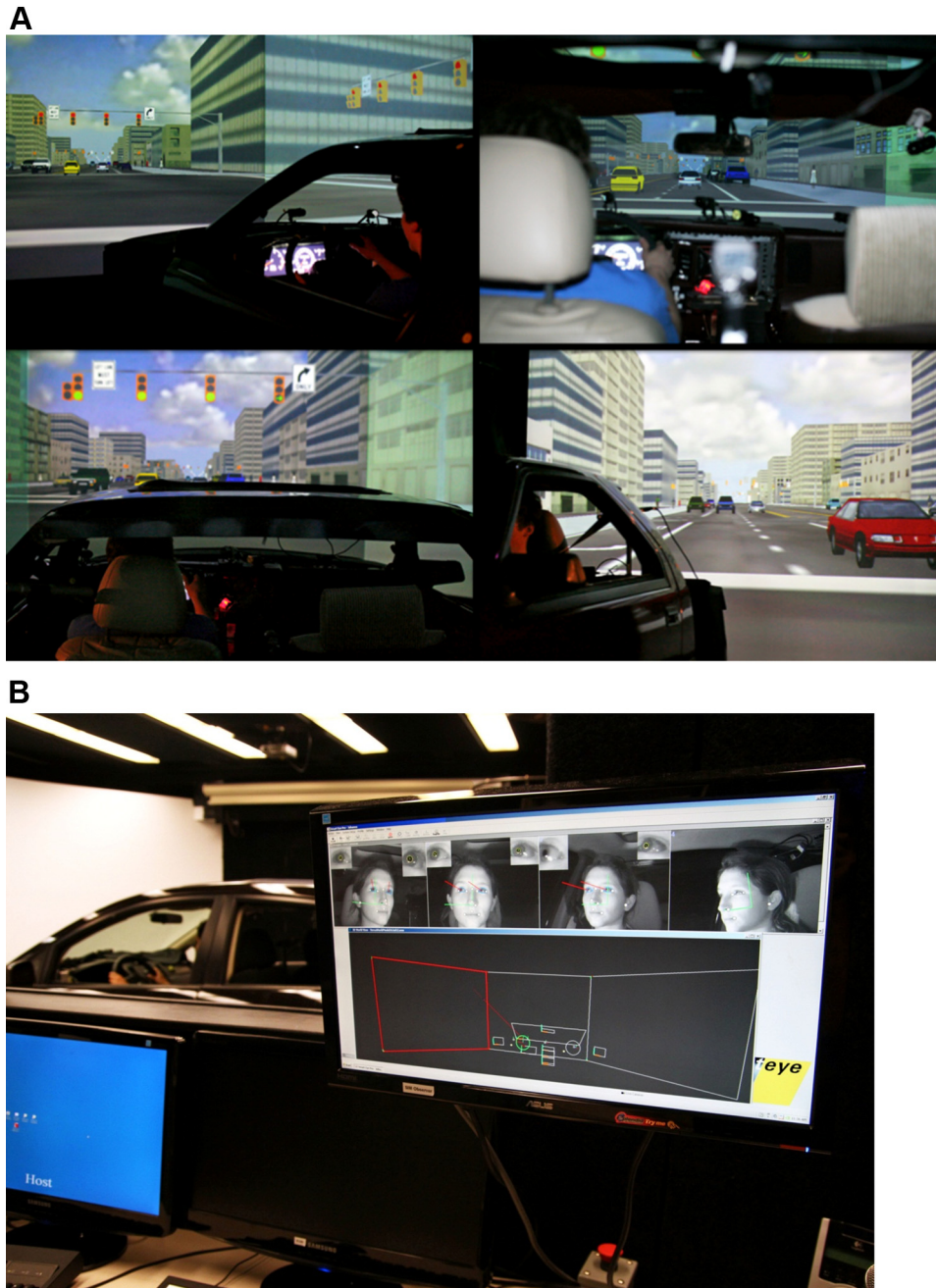
Figure 1. (A) Driving simulator and (B) eye tracker.

is, risk accepting and risk averse, and to interact identically with each participant based on the appropriate condition.